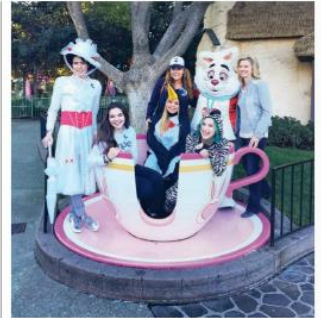
We Are More held a fundraising event at Disneyland.